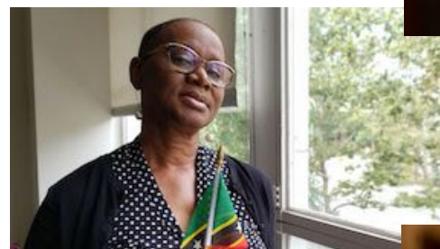
Head of School